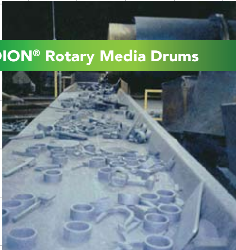
DIDION® Rotary Media Drums